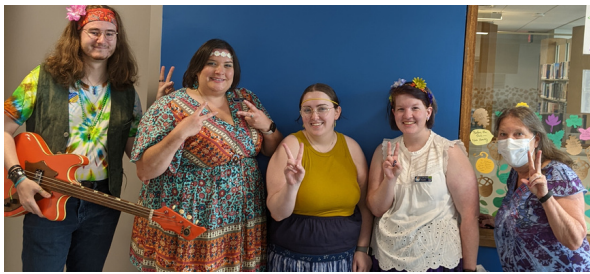
Staff members celebrated the Groovy 60s